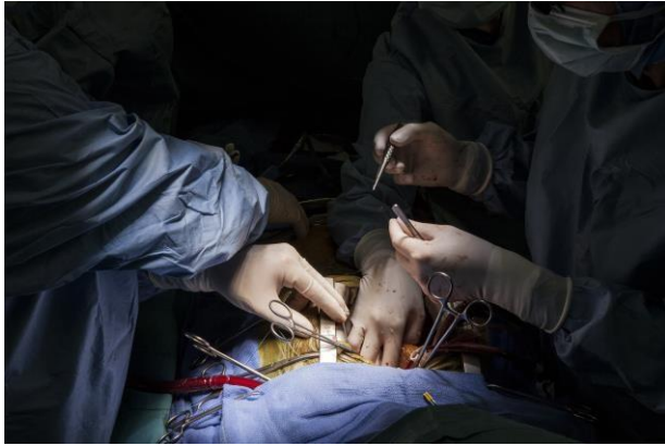
Extract from the installation "III Cœur de beurre" Direct print on brushed aluminum ©Pauline Rousseau La recherche de l'art#8