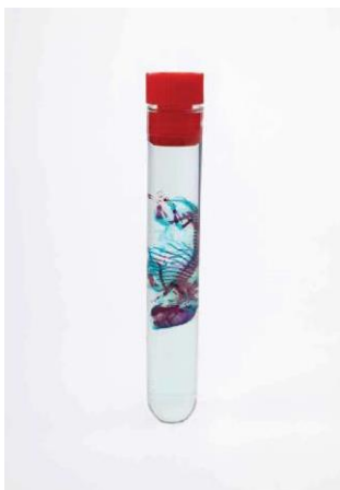
Fœtus Inkjet print 60 x 90 cm ©Diane Hymans La recherche de l'art#8

Throughout the exhibition, the general public will also be able to discover some of the work via the Inserm Instagram account.