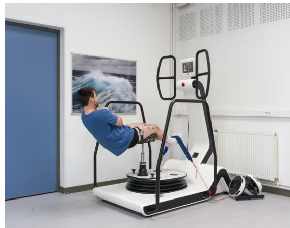
Prince amer de l'écueil (Bitter Prince of the Reef) Inkjet print on matte paper 120 x 150 cm, mounted on Dibond, black frame ©Quentin Carrierre La recherche de l'art#8